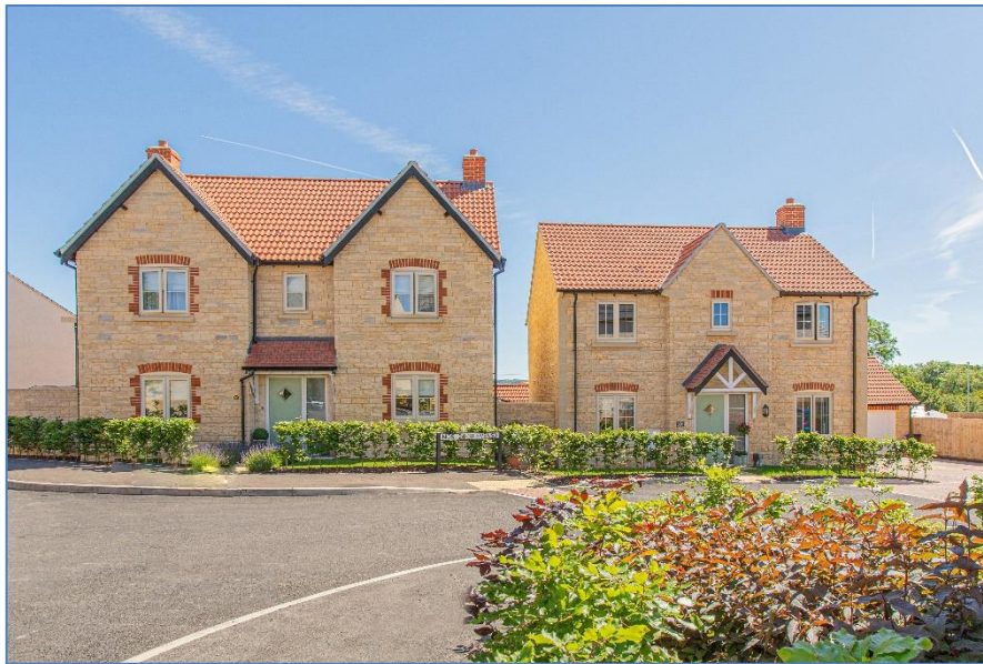
7 Completed Cotswold Homes Buildings using natural Stone

Taking into account the outline consent for this scheme granted at appeal outside of the settlement boundary combined with the levels of ongoing development in the near vicinity of the market town, the proposal is considered to avoid unacceptable levels of harm to the immediate landscape and local character and can be secured by way of conditions. The proposals are, therefore, considered to accord with core policies 51 and 57 of the Wiltshire Core Strategy.