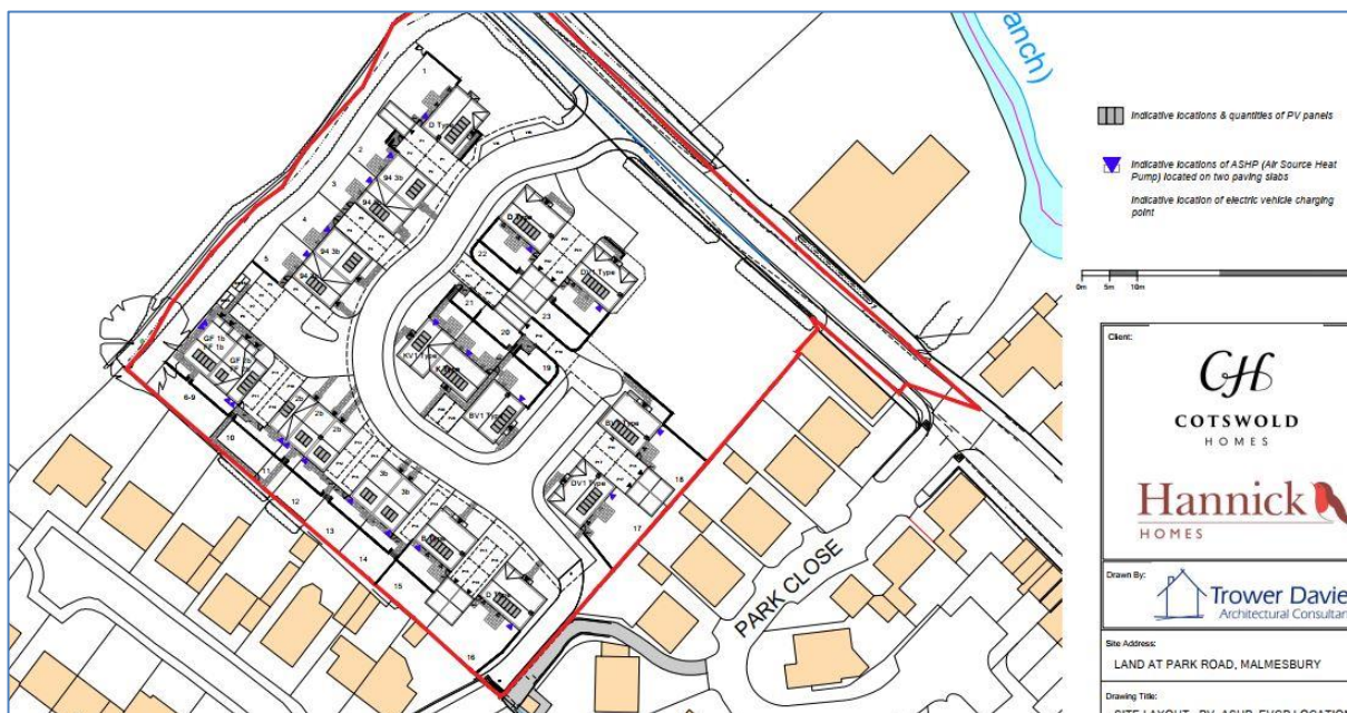
8 Indicative plan showing solar, ashp & car charging

General highway provision across the site has been subject to the tensions inherent between securing a liveable and permeable place while facilitating vehicular movement and also meeting the Council's parking standards as set out in the Local Transport Plan. The proposed site layout meets the relevant standards in this regard. The proposal also includes widespread provision of electric vehicle charging points, whether via posts or wall-mounted outlets (subject to confirmation), as well as cycle and bin storage to an acceptable standard.