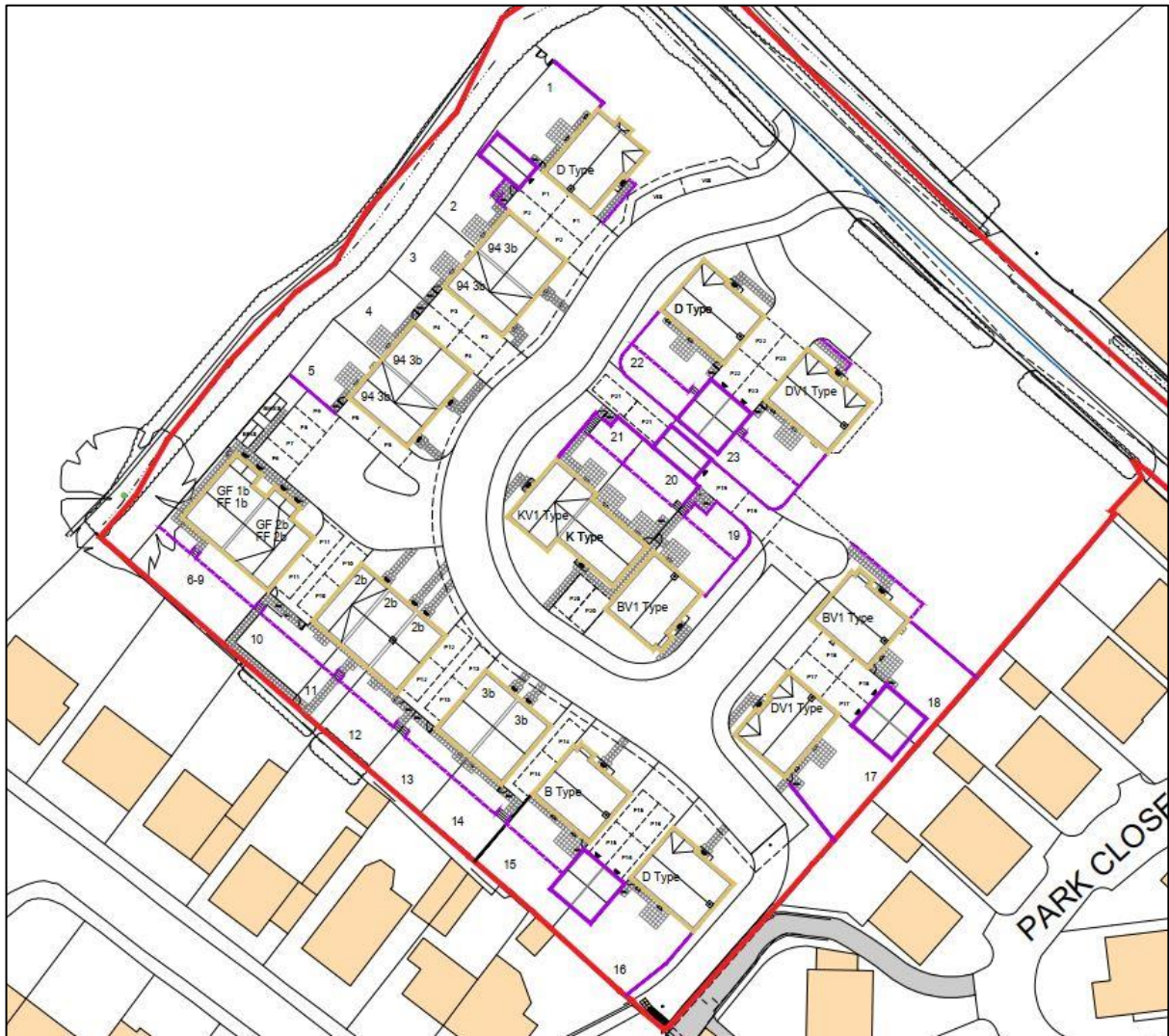
6 cream denotes natural stone purple red brick

Overall, it is considered that the layout of the proposed scheme represents a high quality development of mixed-form housing arranged in such a way as to vary the street scene, a mixture of front and side gables, and whilst certain materials may not fully accord with the design scheme's laid out within the neighbourhood plan, it is further considered that the material palette overall is acceptable and the quality of which can be controlled by conditions attached to any permission. This revised design is considered to result in a legible and permeable scheme that offers a coherent identity with a public realm that offers a pleasant and comfortable environment. Whilst the Urban Design Officer retains some misgivings about certain details, ultimately these elements are minor and not considered to cause unacceptable harm whether in terms of the local character, amenity or other experiential considerations.