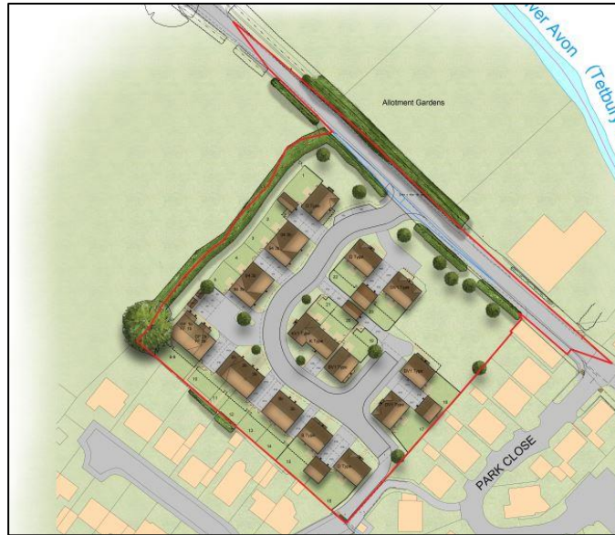
2 Proposed Site Plan